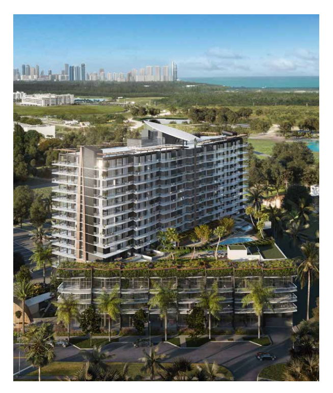
NEXO RESIDENCES IN NORTH MIAMI BEACH, FLORIDA